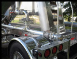
Rear Air Inlet