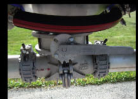
Bottom Drop Tees