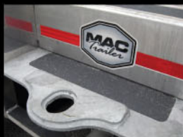
Galvanized Tow Hook