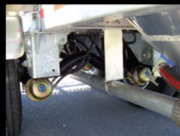
Raised Center Axles