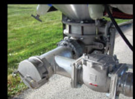
Front Piping Clean-out