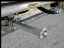
Valve Handle Extensions