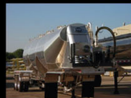
Tank Mounted Blower