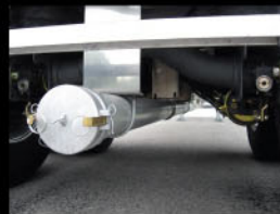
Raised Center Axles