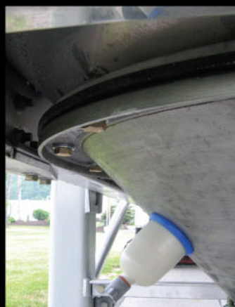
Bolt on Lower Cones